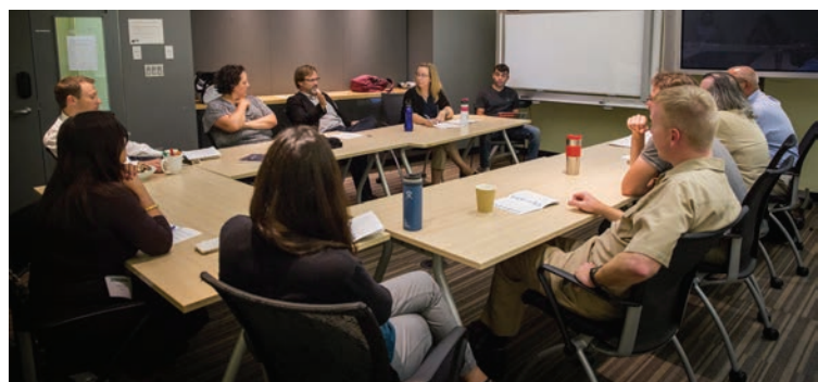
On Sunday afternoon, Forum participants broke into the smaller groups to discuss several questions designed to get them to think about how they can apply new techniques in data science and visualization to ocean exploration in order to understand the ocean in new ways.

Breakout session participants were asked to rely on this common information, as well as their own expertise and experience, to address several questions that the organizers intended to help spark discussion about how new techniques in data science and visualization can be applied to ocean exploration to understand the ocean in new ways and to develop recommendations for ocean exploration stakeholders and specific sectors involved in exploring the deep ocean. Each breakout group then presented the results of their discussions in plenary. Their conclusions are summarized below, organized by question.