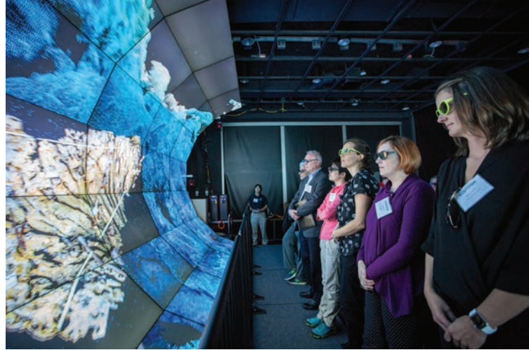
Forum participants learn more about 3D photogrammetry in the WAVElab (Wide Area Virtual Environment).