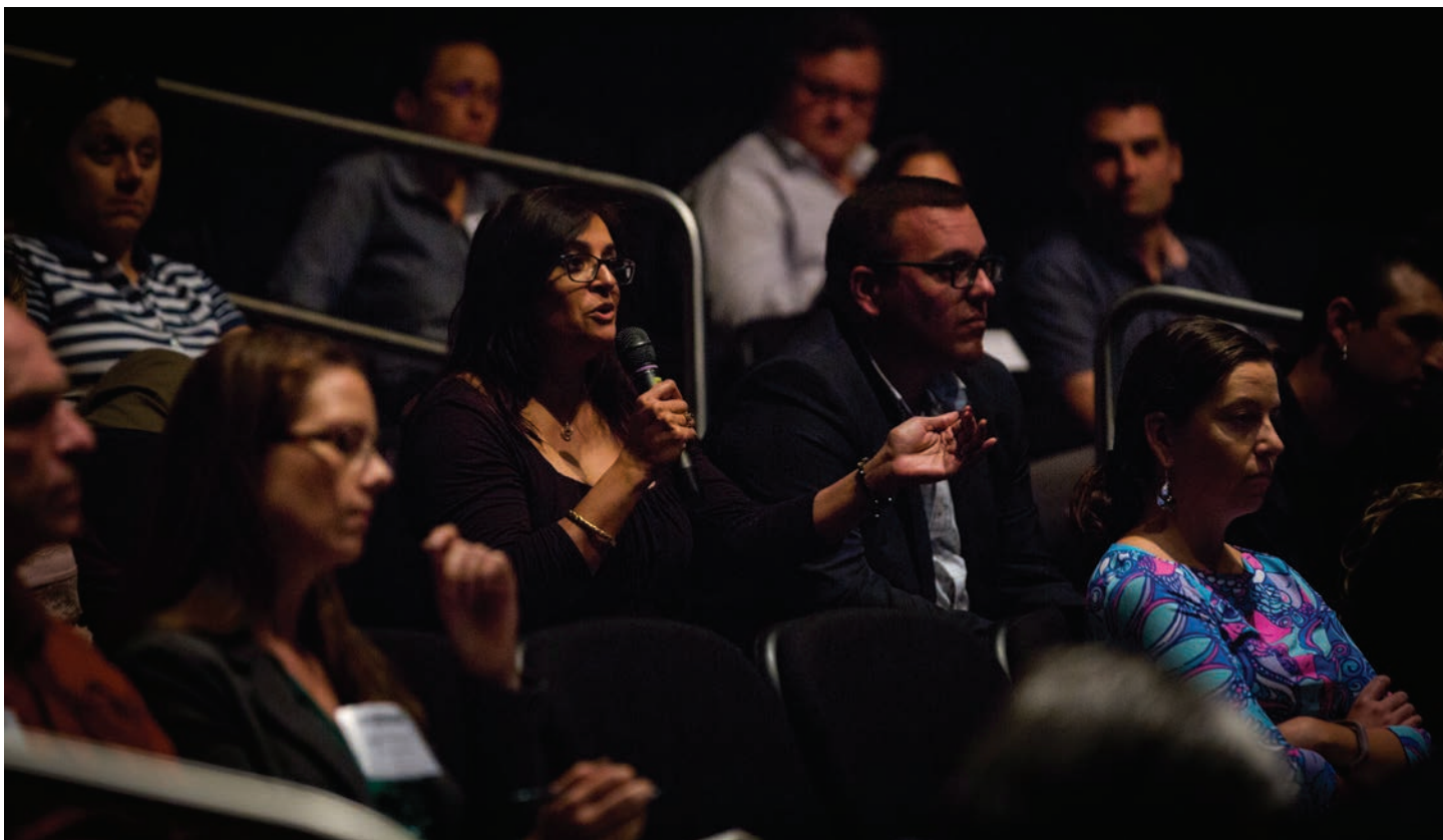
Participants asked questions during the concluding panel, titled “What Should We Do Next?”

NOAA should leverage the abilities of those who already work in ocean exploration and data science. The agency needs to invest more in the curation, production, and presentation of data. NOAA should continue to refine and clarify priorities, then communicate them to the community, in part through facilitating an active conversation between stakeholder groups. Finally, participants agreed that the agency should implement better NOAA branding and increase public engagement, as this will benefit all ocean exploration stakeholders.