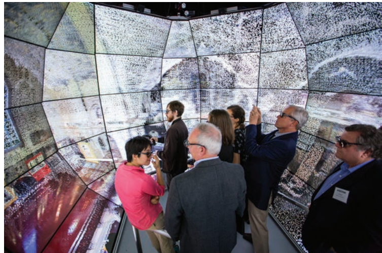
National Ocean Exploration Forum participants explore the SunCAVE, an immersive environment that allows for near-360 degree presentations of video and data.